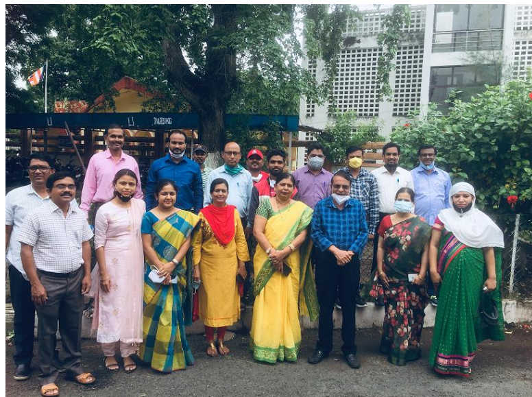
All the teaching and non-teaching staff gathered for tree plantation